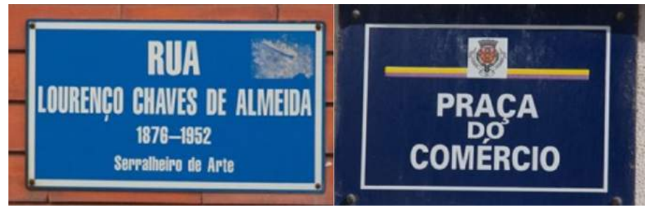
Figure 21, 22. Different PVC signage in Coimbra. The first plate is located at the São Sebastião sidewalk, while the second one is in the downtown.

There is in great number toponymy signage made of polymers like PVC, especially in downtown and the São Sebastião sidewalk, near St. António dos Olivais, Unlike Castelo Branco's example (figure 4) every sign was well conserved and readable, yet with poor legibility. We presume that these plates are prior to 2004, when the Coimbra's toponymy city council established ceramic tiles as its official material (Nunes, 2008).