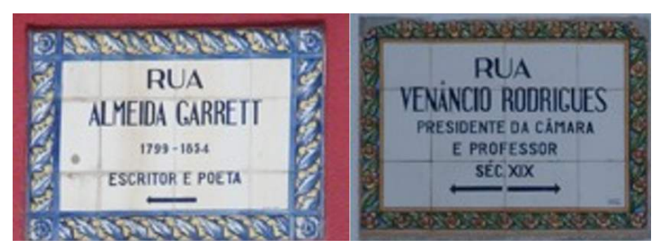
Figure 25, 26. "Venâncio Rodrigues" and "Almeida Garret" streets' toponymy signs have the same typography and similar ornamentation shapes. Source: © Santos, (2015).

It is on ceramic tiles that we will find more typographic diversity but also a stronger design unity trough the several historic stages of this city. For example, "Venâncio Rodrigues" and "Almeida Garret" streets' signs share the same typographic family and information hierarchy with similar ornamental shapes.