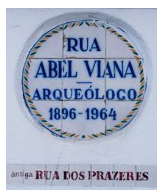
Figure 2. Beja Toponym Signage.

According to the Évora's City Documentation Centre, these secondary toponymy panels appeared, to fulfil the openly expressed population's desire to see the old street names (Afonso, 2014). Those two tile panels (figure 1, 2) are examples of a proper information hierarchy, which takes advantage of the typography's weight, in Évora, and the colour, shape and contrast, in Beja, highlighting the former toponymy instead of the actual ones.