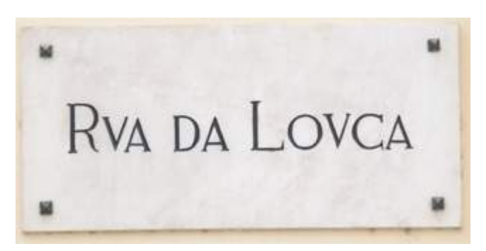
Figure 16. Another marble toponymy signage with a transitional typeface.