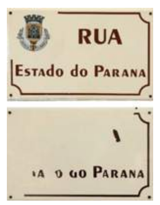
Figure 4. Castelo Branco Toponym PVC signage with information disposed on trimmed vinyl applied on top.

Typography's presence on toponym signage is a piece of evidence that it surpassed the paper printing boundaries coming automatically, ubiquitous and inevitably, into our everyday visual universe on an intangible form (Jury, 2007).