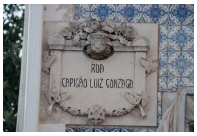
Figure 14. Capitão Luís Gonzaga street has a Second Republic decorative style honouring this World War I national hero.

Coimbra's toponymy signage decoration is abundantly visible on plates where Humanist and Transitional typefaces were applied, yet Capitão Luís Gonzaga (military on service during WWI) street signage decoration is far more complex than the other examples exhibiting the Portuguese Republic symbols and the distinction of the Order of the Tower and Sword. This is a rare example, unique in the city of Coimbra, where signage indicates the role and importance of the honoured person.