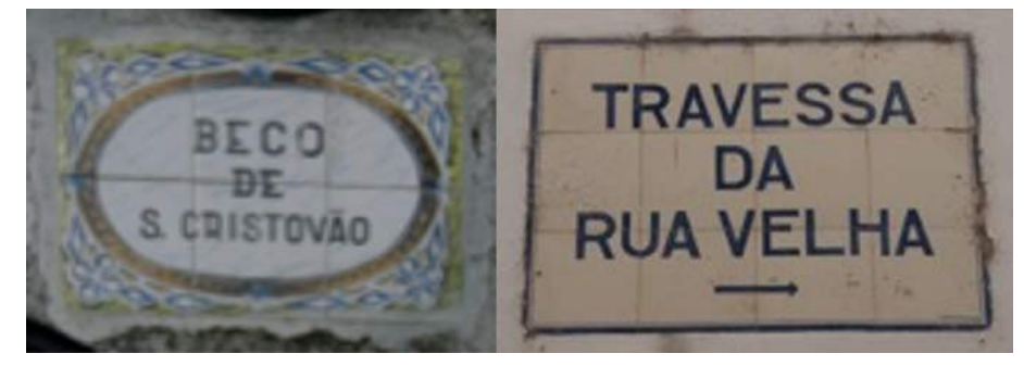
Figure 27, 28. "Travessa da Rua Velha" and "Beco de S. Cristovão" toponymy plates are located in the zones of Coimbra which did not suffer from any intervention during the Second Portuguese Republic.

Letter signs like "Travessa da Rua Velha", in the downtown, or "Beco de S. Cristovão", in the old town, support the hypothesis that ceramics have been used before 1942.