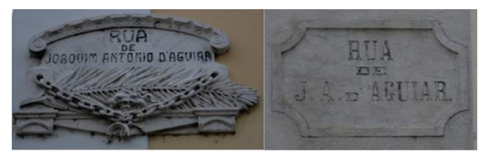
Figure 12, 13. Joaquim António D'Aguiar Street Signage. The first example is possibly from the 1st half of the 20th century, using the elements of the art deco style and a typeface similar to Hobo. The second plate has a mécane typeface like Fernandes Tomás Street, which refers back to the 19th century.

From all the samples made in Stone of Ançã only José António Aguiar Street has more than one signage, presuming that the simpler one is the older one, judging from the level of erosion Typefaces coincidence suggests the hypothesis that the original city toponymy signage used a mécane typeface.