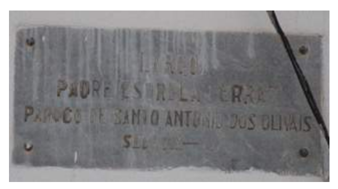
Figure 15. Dark marble toponymy signage. One of the two specimens.

The plates on this material are usually not decorated, with the exception found in figure 18, with simple forms fixed with iron nails in each corner.