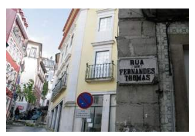
Figure 7. Fernandes de Tomas Street Signage, in Coimbra, and its involving space. An example of how toponymy signage can represent language evolution and date the identify space by its style.

The oldest toponymy of this city has several shapes, forms, and material supports, revealing to those who observe them, several stages or epochs this city has been through. Action research method made indicated us toponymy signage on marble, stone of Ançã, ceramic tiles, polymers and brass supports.