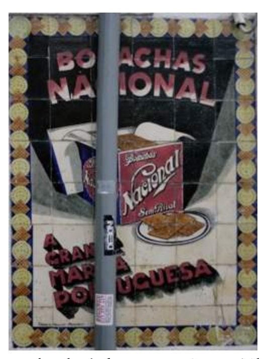
Figure 6. Nacional cookies' advertising on Ceramic Tiles, Coimbra.

During the research, there has been a certain amount of care and attention while registering the surroundings of each sign, as well as other widely available typographic assets. Warnings, posters, advertisings are also a part of each place's identity, so it is possible to interpret that information as an open-air museum, or a museum of the every day, which is bringing a radical transformation of the function of art (Reis, 2012), because if typography makes any sense, it is visual and historical (Bringhurst, 2004). In the course of history, typography has always been an activity at culture and written communication's service (Balius, 2013).