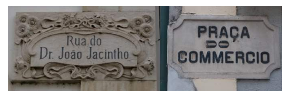
Figure 10, 11. Jacintho and Commercio, old-Portuguese spelling present on the streets of Coimbra.

Thomas, Commercio and Jacintho allow us to infer that this toponymy's date is earlier to the orthographic agreement of 1945 (ILTEC, n.d.). It allows us to familiarise ourselves with the older Portuguese spelling and its evolution.