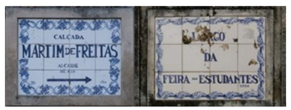
Figure 23, 24. "Calçada Martim de Freitas" and "Largo da Feira dos Estudantes" ceramic tiles signage.