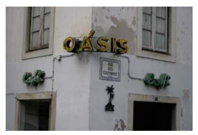
Figure 5. Overall appearance of Café Oasis' letterings at Sé Velha Square, Coimbra.

Typography's presence on toponym signage is a piece of evidence that it surpassed the paper printing boundaries coming automatically, ubiquitous and inevitably, into our everyday visual universe on an intangible form (Jury, 2007).