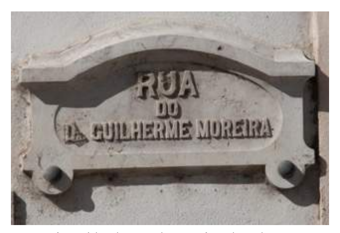
Figure 18. Decorated marble plate with a modern lineal neo-grotesque typeface.