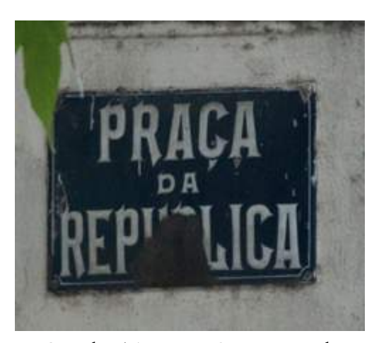
Figure 3. Coimbra Toponym Signage on a brass plate. Source: © Santos, (2014).