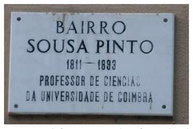
Figure 17. A different transitional typeface combined with a narrow grotesque typeface on a marble plate.