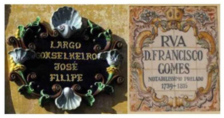
Figure 29, 30. Portuguese Toponymy in Faro (©Santos, 2014) and Caldas da Rainha. Source: © C.M. Caldas da Rainha, (2013).

Typography has way more power than A SIMPLE COMMUNICATION MEDIATOR has it absorbs and reflects THE SPIRIT OF ITS OWN TIME.