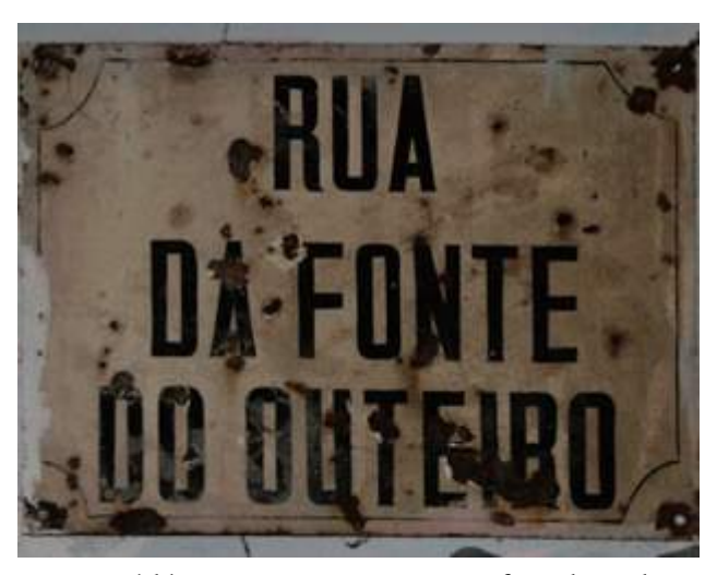
Figure 20. An old brass toponymy sign was found inside Pra-Kis-Tão students republic while using action-research methodology.

There is in great number toponymy signage made of polymers like PVC, especially in downtown and the São Sebastião sidewalk, near St. António dos Olivais, Unlike Castelo Branco's example (figure 4) every sign was well conserved and readable, yet with poor legibility. We presume that these plates are prior to 2004, when the Coimbra's toponymy city council established ceramic tiles as its official material (Nunes, 2008).