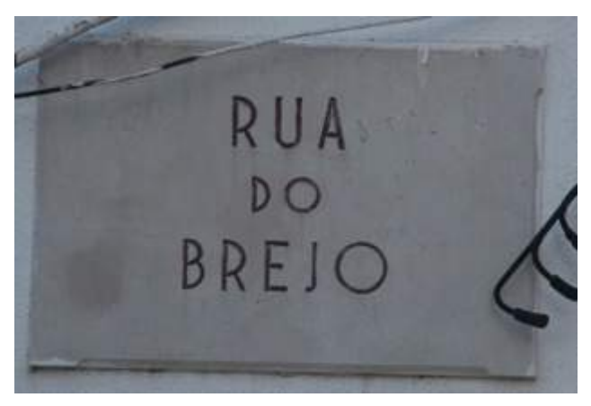
Figure 19. A rare specimen using a geometric typeface

Toponymy signage on metallic supports is even more scarce in Coimbra. During this research, we have only found one plate using this material in the city streets (figure 3). However, we have found another two plates inside the Pra-Kis-Tão students' republic house which we could not confirm, until today, if they were indeed from the old streets of Coimbra.