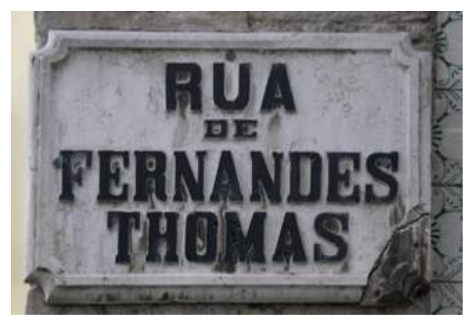
Figure 8. Fernandes de Tomás Street Signage, in Coimbra. Closer perspective on this mécane typeface on Stone of Ançã. Tomás is written in the old Portuguese.