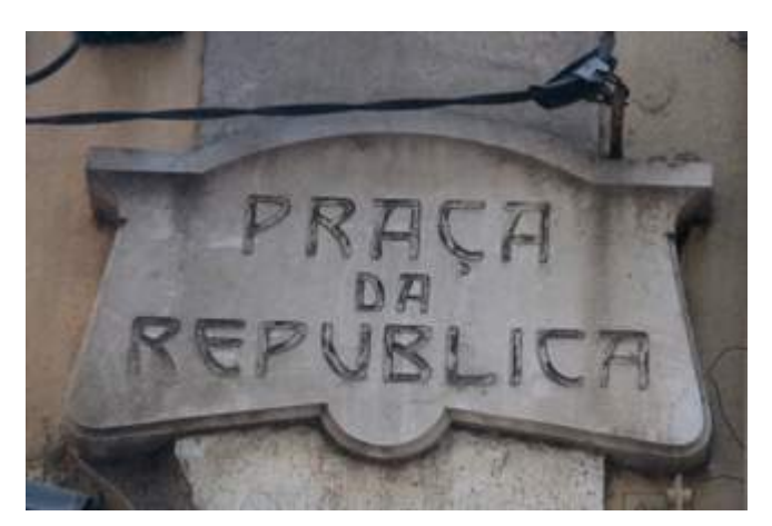
Figure 9. Praça da República Street Signage, in Coimbra. One example of art deco in Coimbra's toponymy.

Thomas, Commercio and Jacintho allow us to infer that this toponymy's date is earlier to the orthographic agreement of 1945 (ILTEC, n.d.). It allows us to familiarise ourselves with the older Portuguese spelling and its evolution.